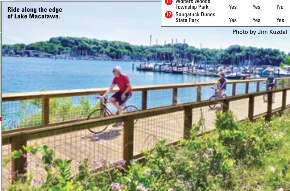
Ride along the edge of Lake Macatawa.